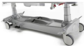
BT0015 -FOUR ANTISTATIC WHEELS FOR SLIM STRETCHER