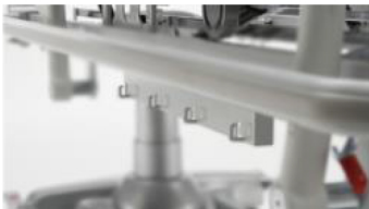
BT0070 -LATERAL BAG SUPPORT ( RIGHT OR LEFT)