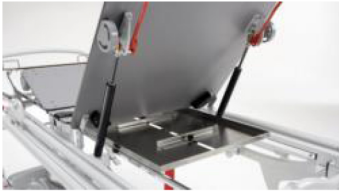
BT0055 -X-RAY CASSETTE FOR SLIM STRETCHERS