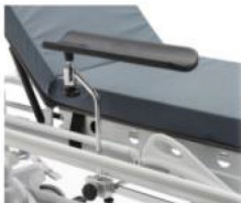
BT0080 -ARMREST TO BE APPLIED ON THE LATERAL ACCESSORIES BAR (BT0075) - FOR SLIM STRETCHERS