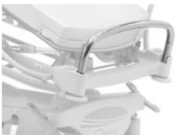
BT0030 -PUSH HANDLE FOR SLIM STRETCHERS