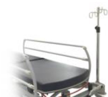
BT0060 -REMOVABLE I.V STAND, ADJUSTABLE HEIGHT, WITH 4 HOOKS