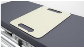
BT0035 -BOARD FOR HEART MASSAGE FOR SLIM STRETCHERS