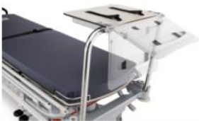
BT0025 -FOOT PANEL AS SHELF FOR MONITOR AND INTEGRATED DOCUMENTS COMPARTMENT