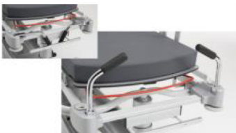
BT0040 -PAIR OF RETRACTABLE PUSH HANDLES FOR SLIM STRETCHERS