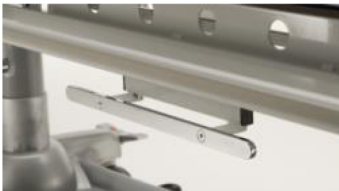
BT0075 -LATERAL SUPPORT FOR ACCESSORIES (LEFT OR RIGHT) - FOR SLIM STRETCHERS