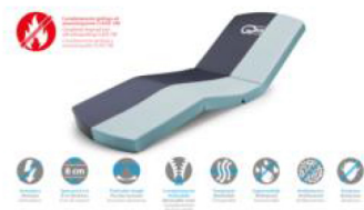
BT0010 -ANTISTATIC MATTRESS FOR SLIM STRECHTERS