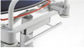
BT0050 -ACCESSORY HOLDER FOR STRECHTER HEAD SIDE