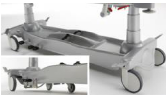
BT0017 -SET 4 WHEELS Ø MM. 200 PLUS 1 Ø 100 MM. FOR STRECHTERS