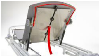
BT0065 -SUPPORTS FOR THE ANCHORING OF THE X-RAY CASSETTE ON THE BACKREST OF SLIM STRETCHERS