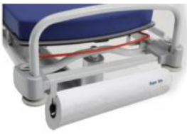
BT0045 -PAPER HOLDER FOR SLIM STRECHTERS