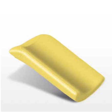
AV4082 Covering made of fireproof plastic class 1 IM (additional covering for AV4081)