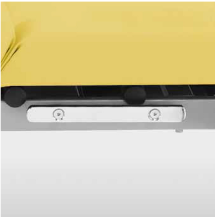
AV4088 Couple of lateral profiles for coupling of all accessories