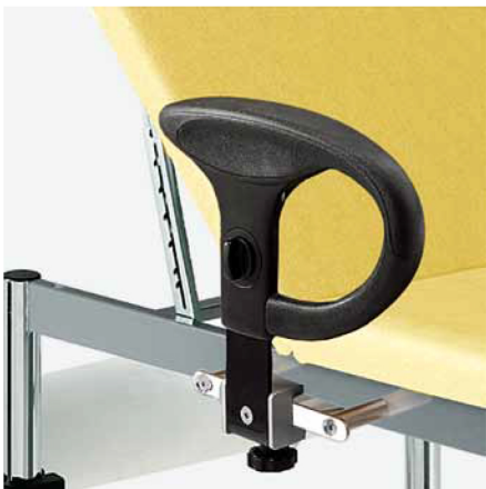
AV4074 Adjustable handles made of soft integral polyurethane, usable as small siderails