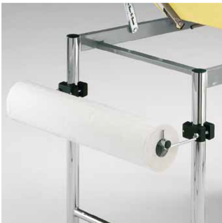
AV4097B Paper roll support mounted on the bed base, with support made of chromed steel