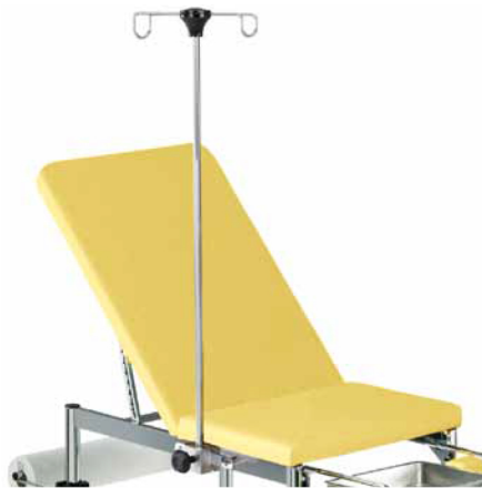
AV4098 I. V. stand with two hooks made of chromed steel with clamp for height adjustment, to be hooked on lateral profiles