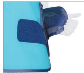
Velcro closure – side