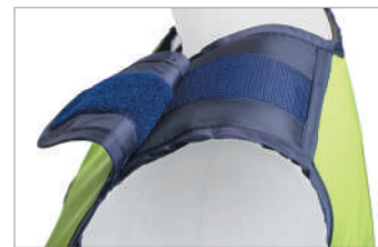
Velcro closure – shoulder