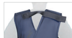
Closure A: Velcro flap between the shoulders