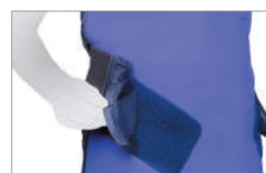
Velcro closure – Side