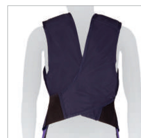
Closure C: Elasticated Velcro fastening provides individual fit