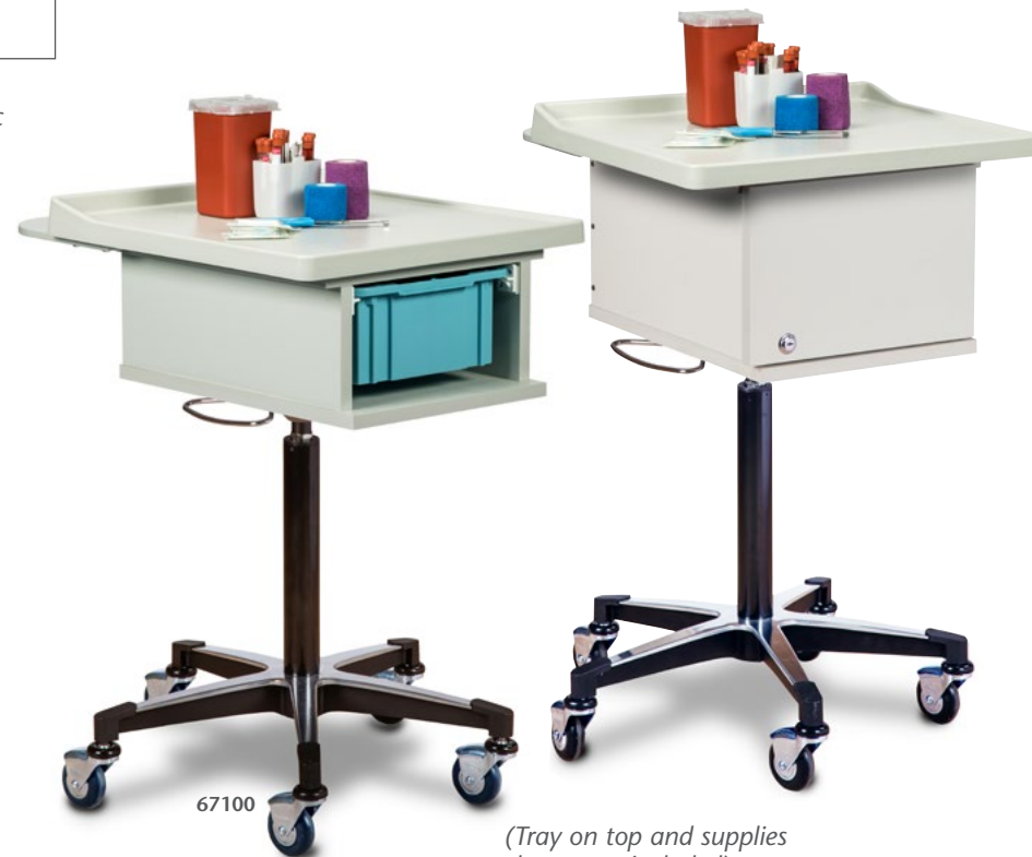
(Tray on top and supplies shown not included)