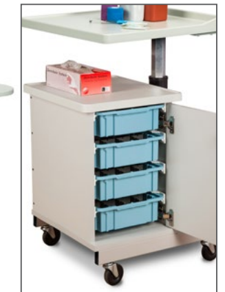
Four plastic bins slide on plastic channels