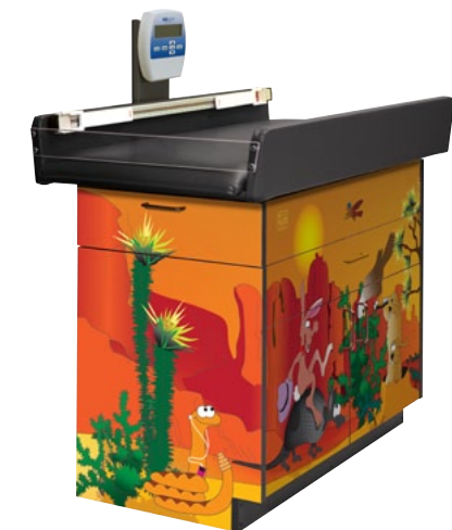
left side detail