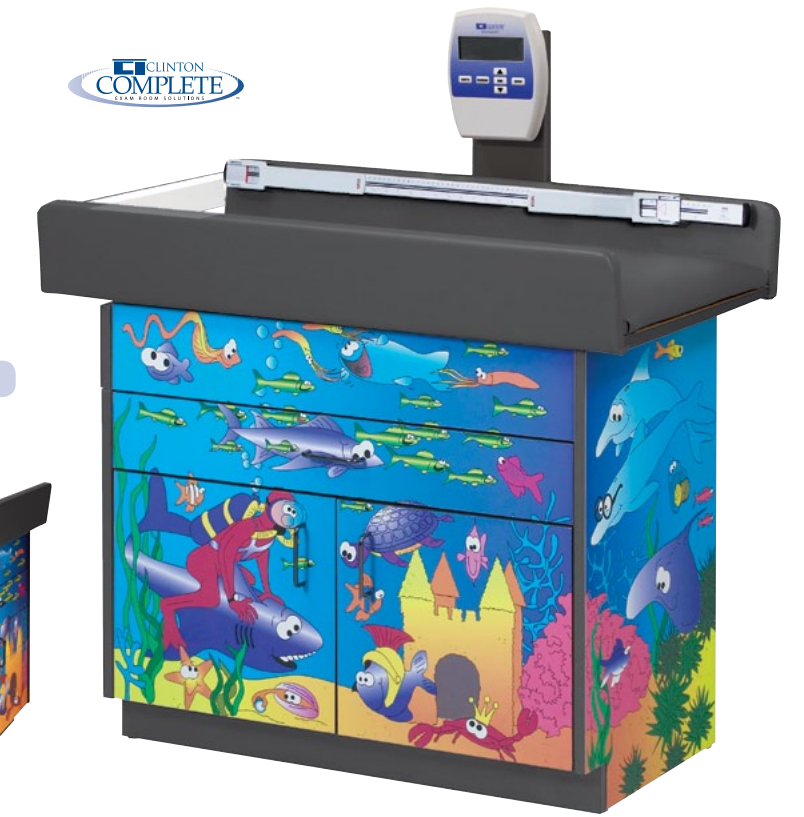
left side detail