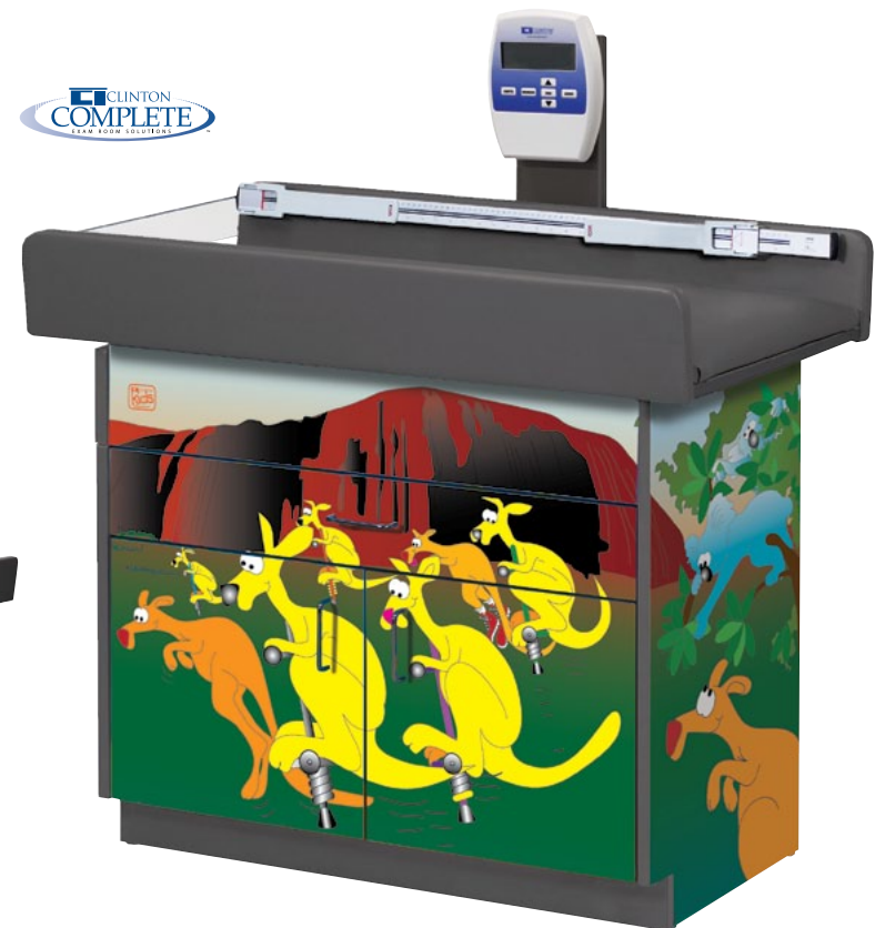
left side detail