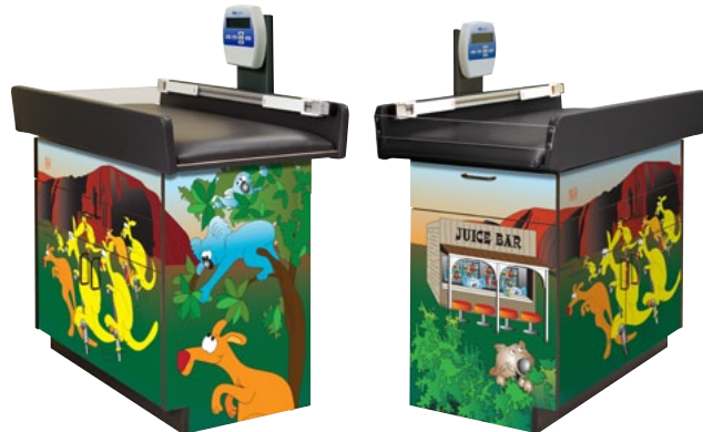
right side detail

7853-X Must order using this model # for package discount