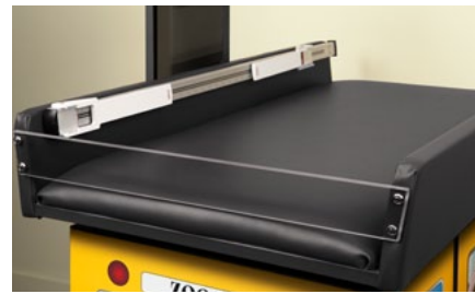
top rimmed on 3 sides