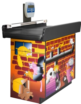
left side detail