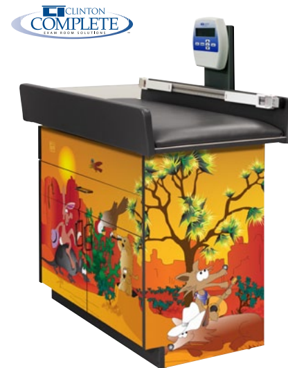
right side detail

7852-X Must order using this model # for package discount