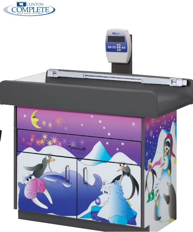
left side detail