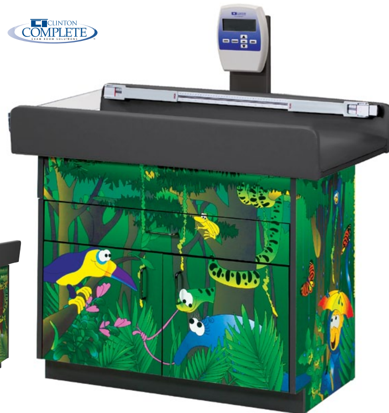
left side detail