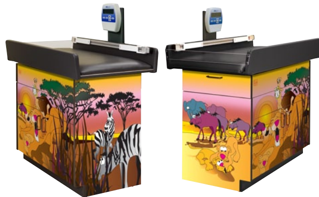
right side detail

7851-X Must order using this model # for package discount