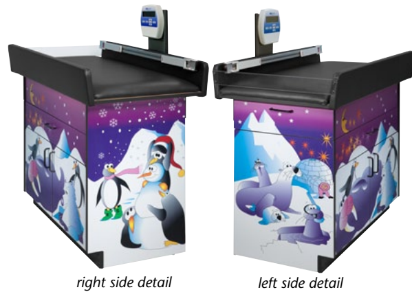
right side detail

7831-X Must order using this model # for package discount