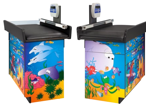
right side detail

7836-X Must order using this model # for package discount