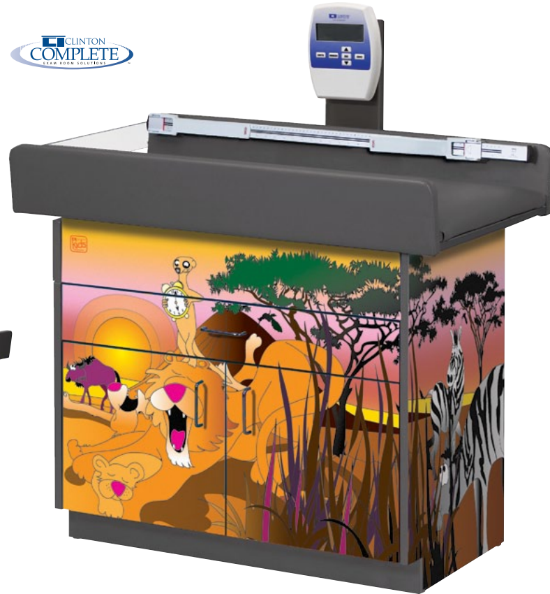
left side detail