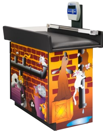
right side detail