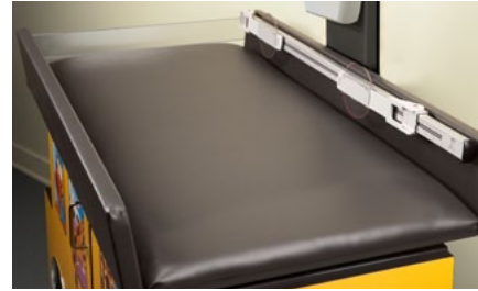
beveled sides & rounded corners