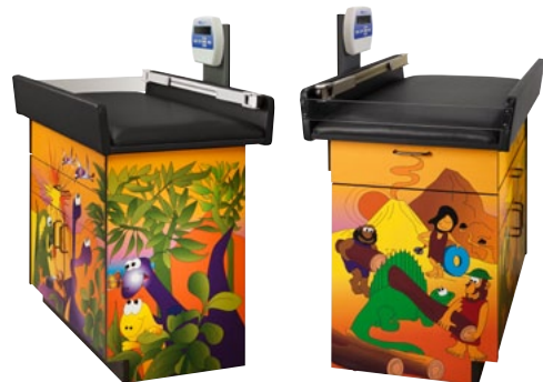
right side detail