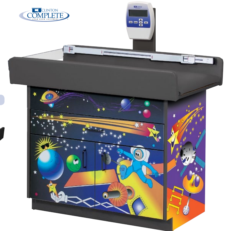
left side detail