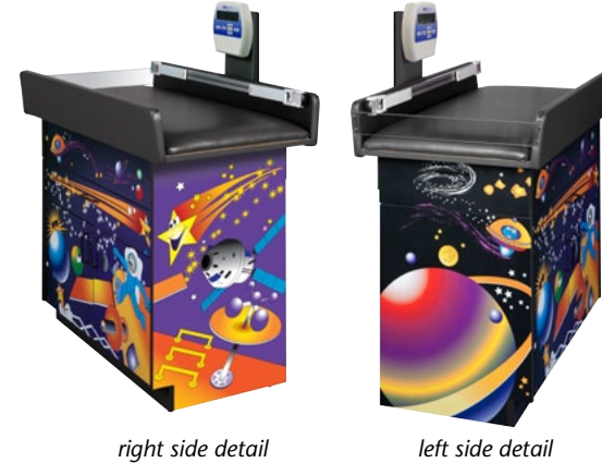
right side detail

7835-X Must order using this model # for package discount