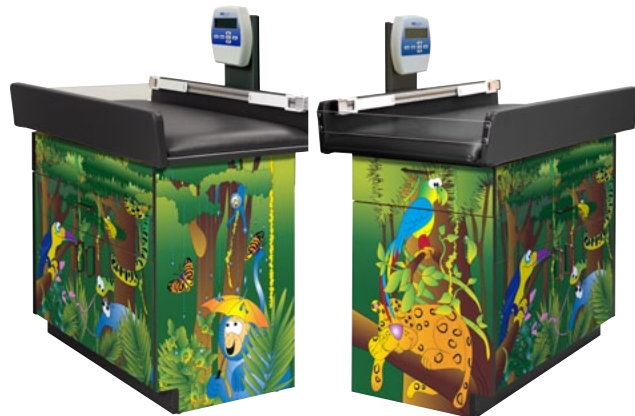
right side detail

7832-X Must order using this model # for package discount