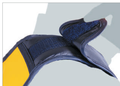
Velcro Closure – Shoulder