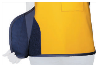
Velcro Closure – Side