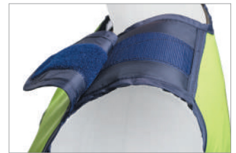
Velcro closure – Shoulder