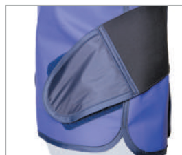
Velcro closure – side