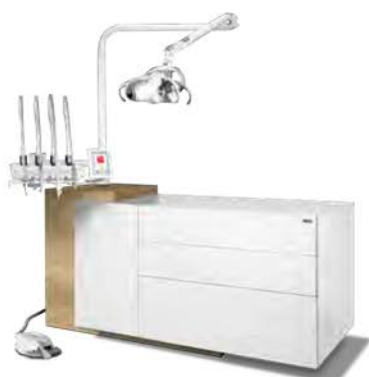
Example : right hand with suction Tray : white glass Light : MAIA PODO Arm system : Springflex 4 tools