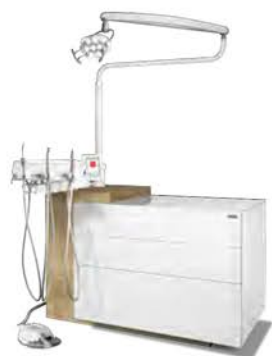
Example : right hand Tray : white glass Light : SUNLED Arm system : H-Flex - 3 HC