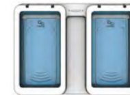
FEET PRINT 4.0 EXPERT