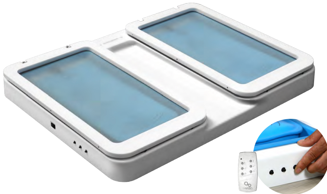
Remote control and lateral control