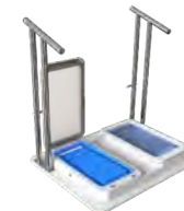
Stand with support handle