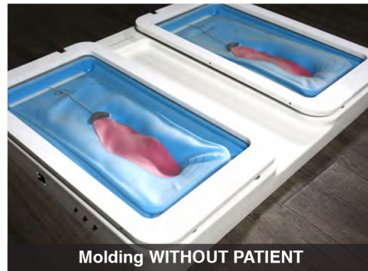
Molding WITHOUT PATIENT