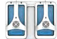
FEET PRINT 4.0 EXPERT INTEGRATED COOLING SYSTEM